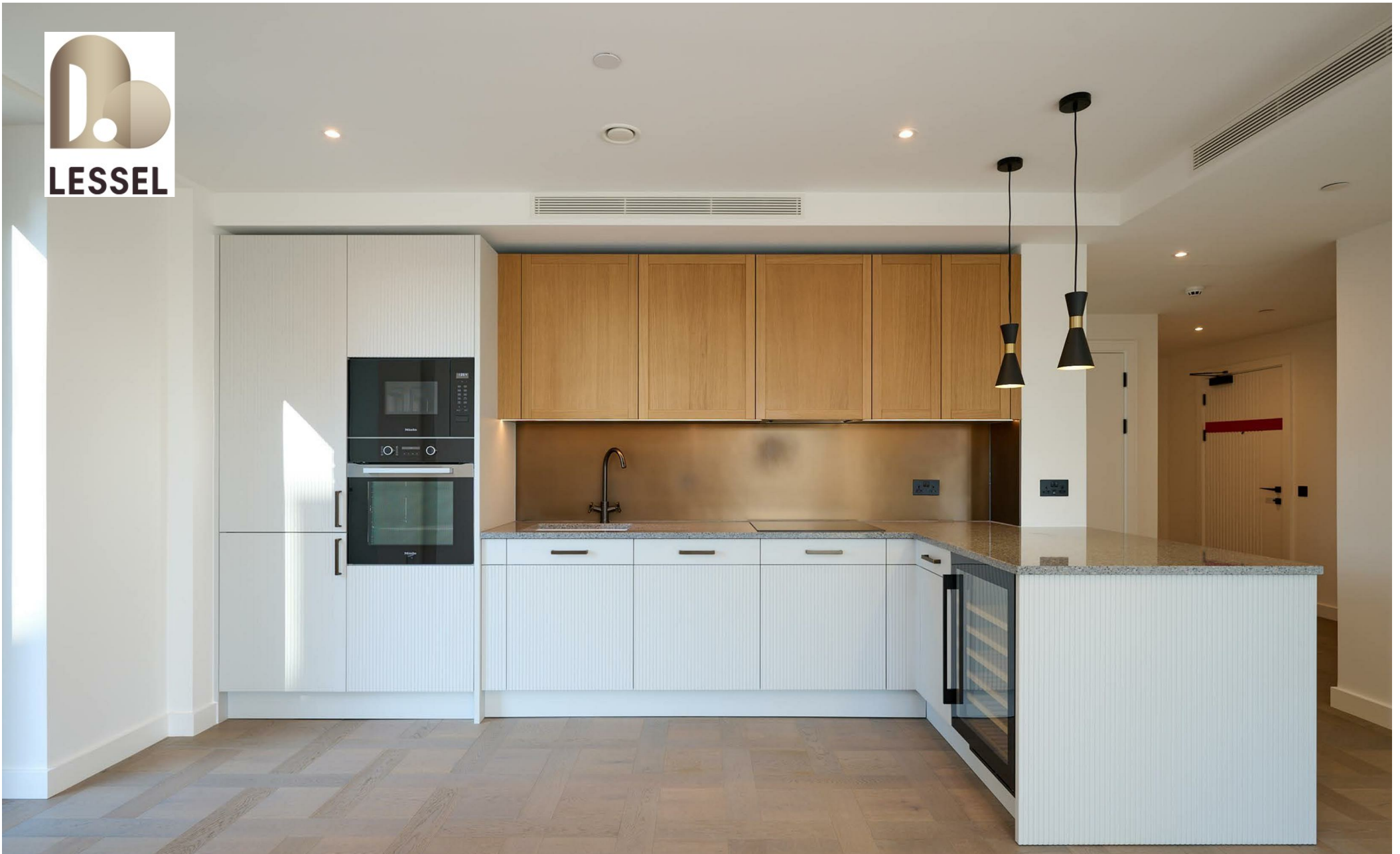
Apartment 308 4 Merino Gardens, London, E1W 2DS £875 Per Week